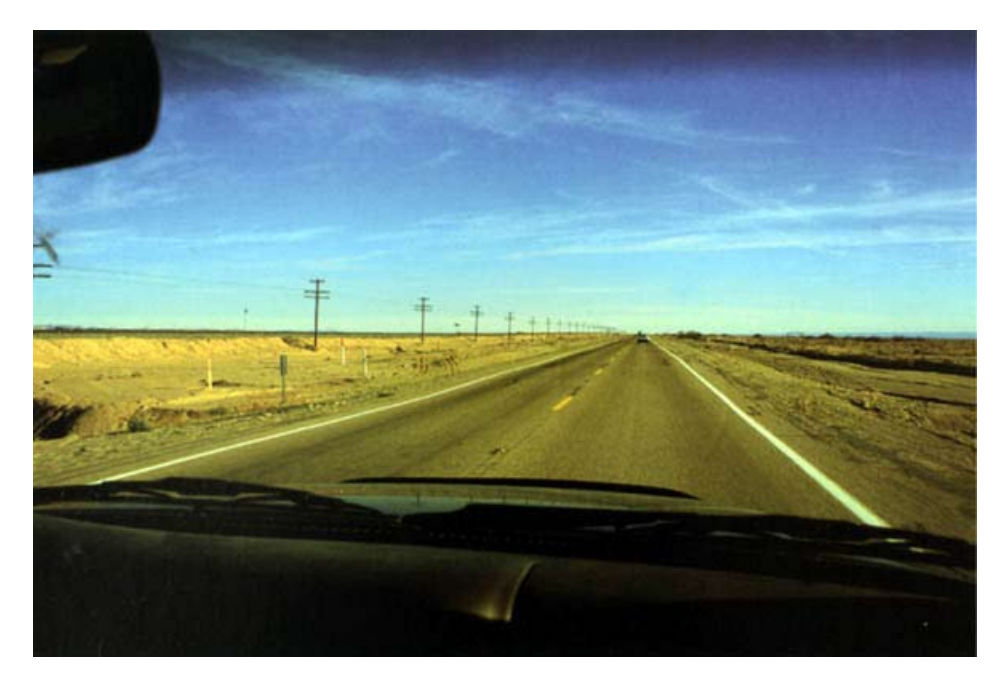
off about a year and a half ago, and I feel like I'm still in this holding pattern, just kind of circling and thinking, processing ideas.

M: With the Design Within Reach catalogue, everything has to do with visual comfort.