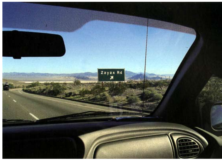
fig. 28 Highway sign for Zzyzx Road, Mohave Desert , California, 2004