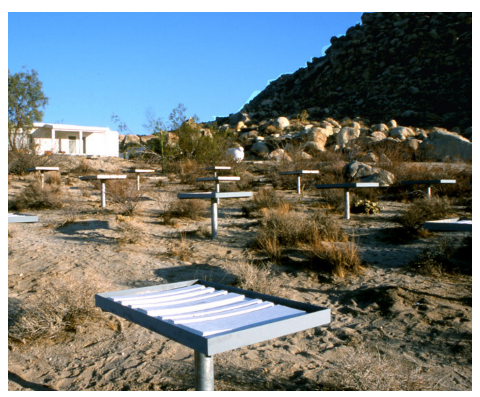
View of The Regenerating Field, 2002, a grid of 25 steel trays for recyclling paper; in front of the A-Z West Homestead, Joshua Tree.

into something useful, like furniture, this advanced technology has yet to live up to its name.