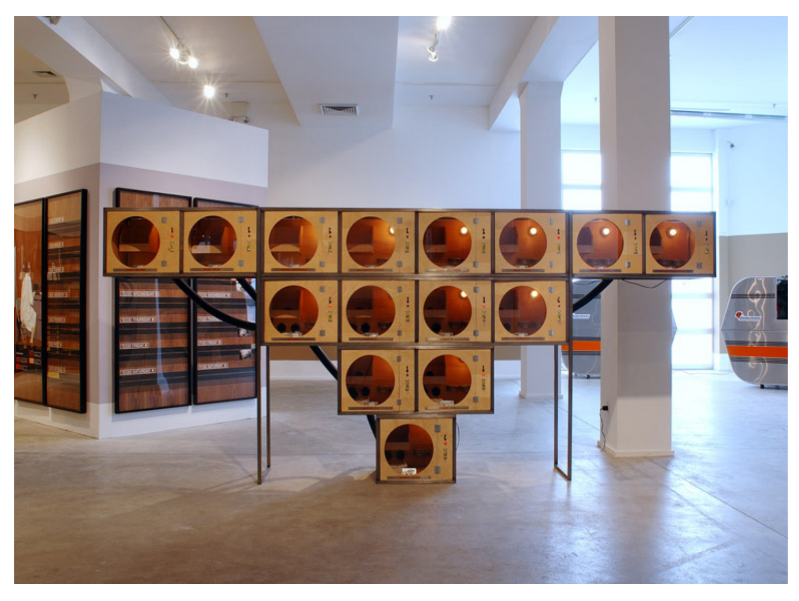
A-Z Breeding Unit ofr Averaging Eight Breeds, 1993, steel, glass, wood, wool, lightbulbs and electric wiring, 72 by 171 by 18 inches; at the New Museum. Museum of Contemporary Art, Los Angeles.

ject, conducting experiments on her own life. One of her first functional domestic environments, A-Z Management and Maintenance Unit, Model 003 (1992) was fitted to her 200-square-foot apartment in Brooklyn. In a configuration familiar to space-challenged New Yorkers, it combines a sink, storage space, a cooking and dining area and sleeping loft in a compact, roughly 7-by-8-by-6-foot space. By 1994 Zittel had moved to larger quarters in Brooklyn (which would become known as A-Z East after her relocation to Joshua Tree in 2000), where she was able to spread out and set up a "personal presentation room" and a "testing ground" to further develop her living solutions.